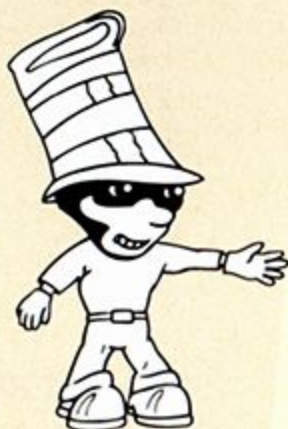
Colin the Crazy Clown—50