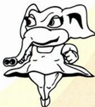
Bertha the Ballerina—200