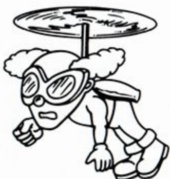
Baz the Bomber—150