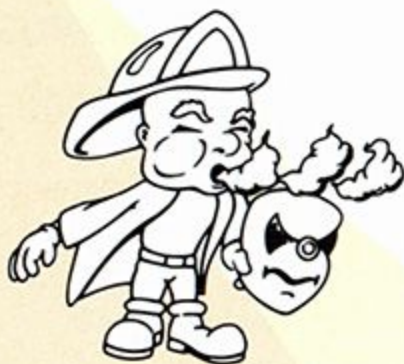
Franco the Fire Breather—200